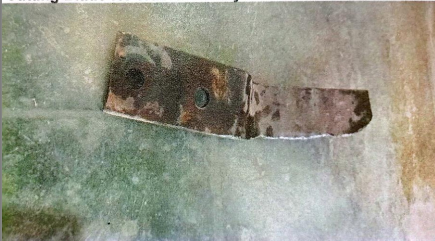
Cutting Blade for Tractor Rotary Lown Mower Machine

7 Cutting Blade for Tractor lawn Mower machine 52" Size: 19" inch + 4" inch width + ½ " inch Thickness ( With 2 hole)