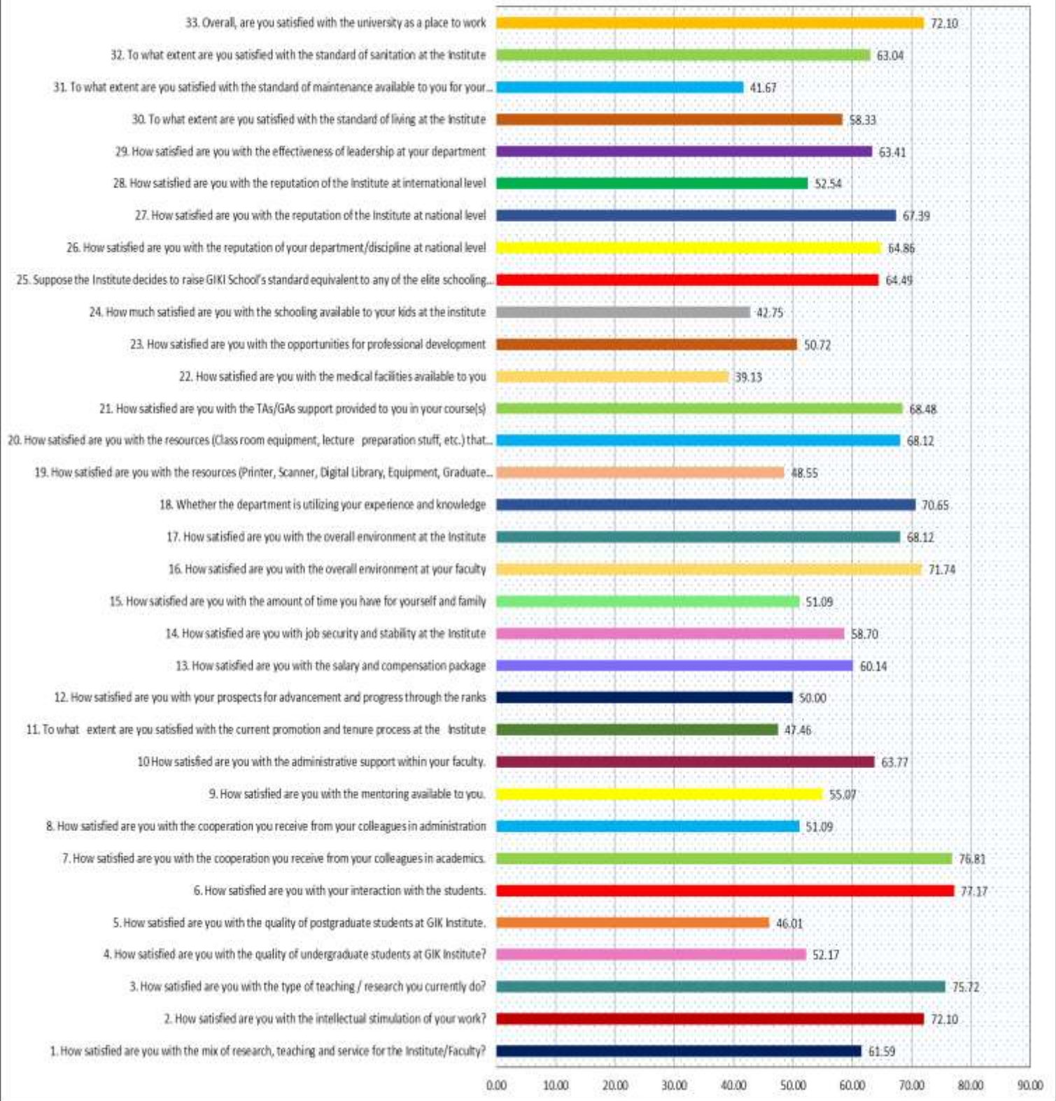
Figure 1: Average Score in Questions 1 to 33 in Bar chart form